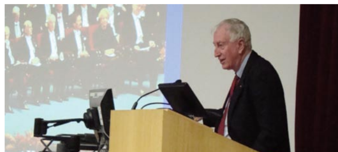
Professor Peter Doherty at the Dare Shott Lecture

Professor Doherty was Australian of the Year in 1997, and has since been commuting between St Jude Children's Research Hospital in Memphis and the Department of Microbiology and Immunology at the University of Melbourne.